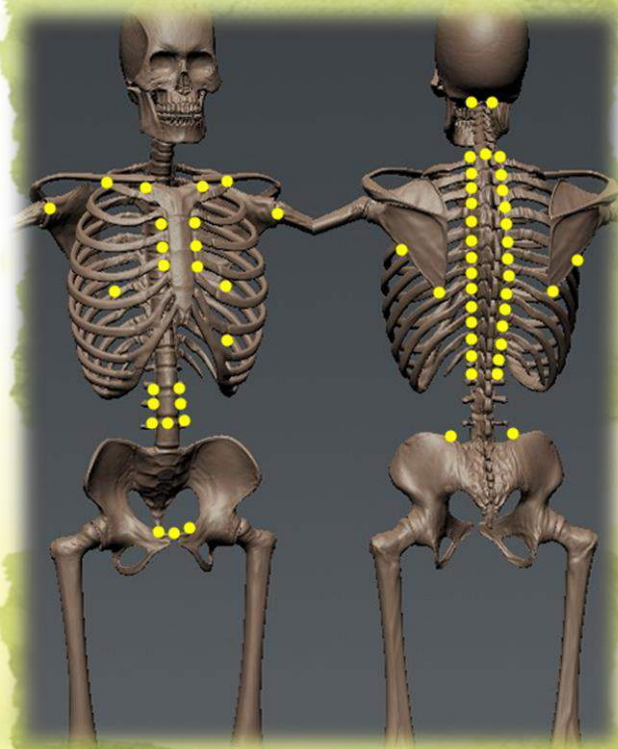
Front and Back Locations of Major Neuro-Lymphatic Massage Points

Note: These points are massaged clockwise to strengthen and counterclockwise to weaken. Because you would only want to weaken an area that is hyperactive, you would ALWAYS move in a counter-clockwise direction. You can use your fingers, thumbs, or knuckles. You are looking for tightness, thickness, tenderness or pain.